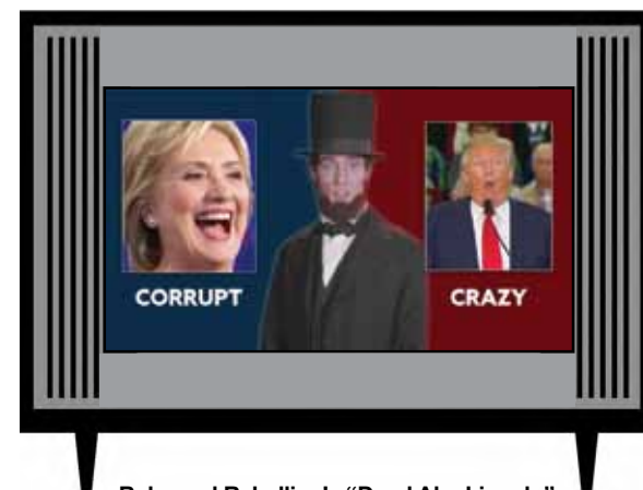
Balanced Rebellion's "Dead Abe Lincoln" TV ad promoting Johnson-Weld 2016