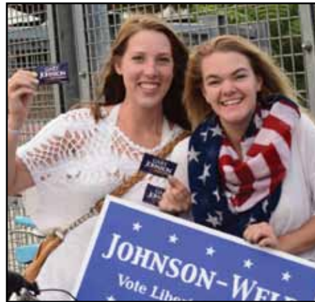
Colorado Libertarians promoting Johnson-Weld 2016 to motorists on game day

grassroots activists gathered on a Denver overpass, just before a Denver Broncos game, with both home-made and professionally printed signs showing their support for Gary Johnson and inviting motorists to honk. The honking was nearly nonstop. Party spokespersons have been interviewed for important local news outlets including the Denver Post , Westword , and Colorado Public Radio.