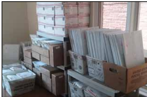
Boxes and outbound packages fill LP HQ daily in Alexandria.