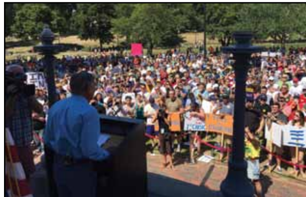
Gary Johnson speaking at a rally in Boston on August 27

When asked how best to ensure a quality education,