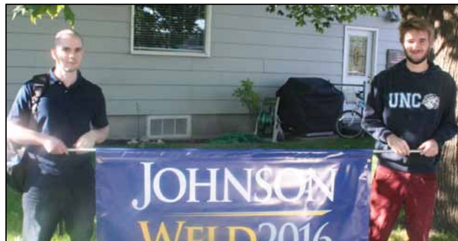
LP Montana activists ready to march in the Independence Day parade in Kalispell

MTLP hit the parade route as well, with entries in the Heritage Day Parade in Stevensville, Kalispell's Fourth of July parade, the Kalispell Fair parade, and the Ravalli County Fair parade. At the time of this writing, we are making plans to march in the University of Montana homecoming parade in October.